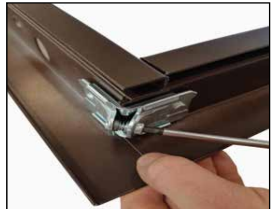
3 - Tighten the screw by applying pressure with your fingers to align the corner of the frame.