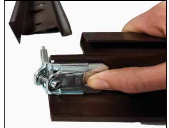
1 - Insert the bracket in the headboard.