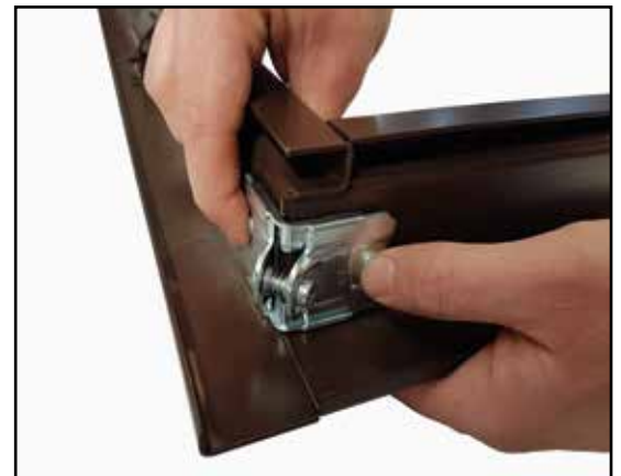
2 - Bring your leg closer and insert the square.