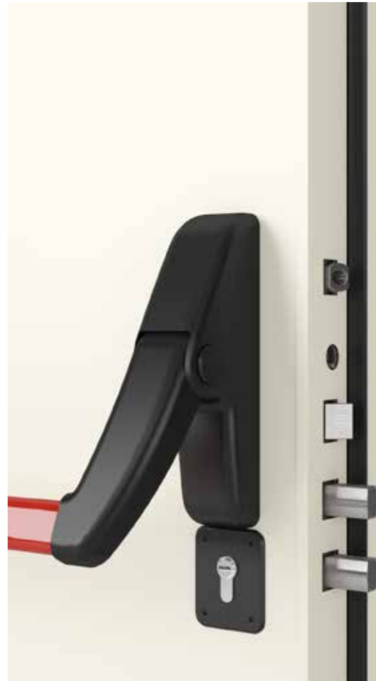
The Mottura Gorilla panic handlebar is combined with its lock and approved as an emergency exit.

Features of panic handlebar and security locks in relation to Directive 89/106/EEC