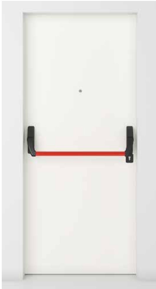
Mottura Gorilla 86530 panic handlebar and security lock.